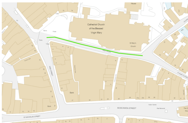
Suspension of one way

To enable delivery vehicles to access the area, the one-way system on High Cross will be temporarily suspended, allowing two-way traffic flow while Boscawen Street is closed.